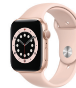
Apple Watch Series 6